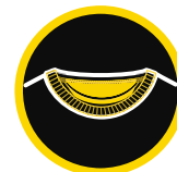
HALF MOON YOKE