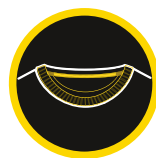
TAPED NECKLINE FOR COMFORT