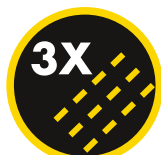
TRIPLE STITCHED SEAMS