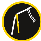
SET IN SLEEVE