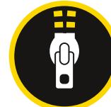
FULL FRONT ZIP WITH STUDDED STORM FLAP