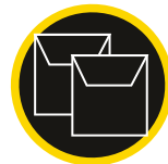
TWO LOWER POCKETS WITH HOOK AND LOOP FASTENING FLAPS & HAND WARMERS