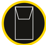
MOBILE PHONE POCKET ON CHEST