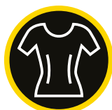
BUST DARTS FOR BETTER SHAPE