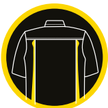
BACK ACTION PLEATS