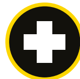
ESSENTIAL HEALTHCARE WEAR